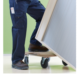
Carcass firmly dowelled and glued ex works