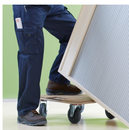
Carcass firmly dowelled and glued ex works