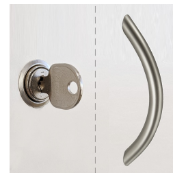
1 OH cabinet with handle or lock