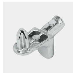
Pull-out proof shelf supports