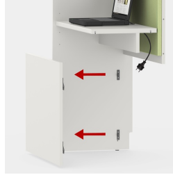
Removable bezel for easy cable routing