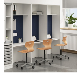
Side panels for better glare and privacy protection