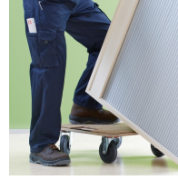
Carcass firmly dowelled and glued ex works