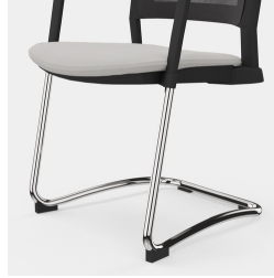
Robust cantilever frame