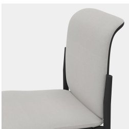
Ergonomically shaped backrest