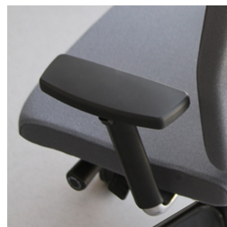
Height adjustable armrests