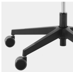
Elegant, sturdy black plastic base