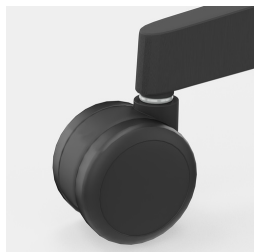
Load-dependent braked safety casters prevent unintentional rolling away