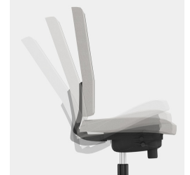
Synchronous mechanism: Spring force or resistance adjustable to body weight