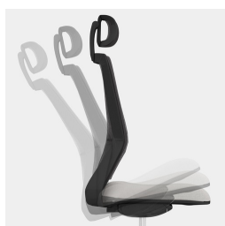
Self-weighting synchronous mechanism automatically adjusts spring force or resistance