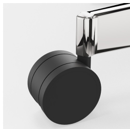
Load-dependent braked safety casters prevent unintentional rolling away