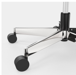
Elegant, high-quality aluminum base