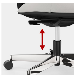
Stepless gas lift height adjustment includes seat depth suspension