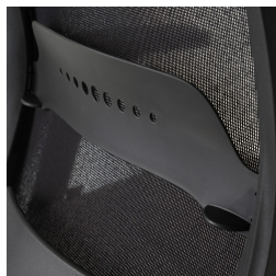
Black mesh backrest, with lumbar support adjustment