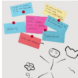
Magnetic surface can be written on with whiteboard pens