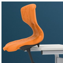
Table suspension protects the table when it is stacked