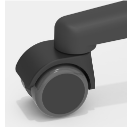
Optionally with load-dependent braked casters