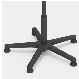
Extremely robust black plastic base