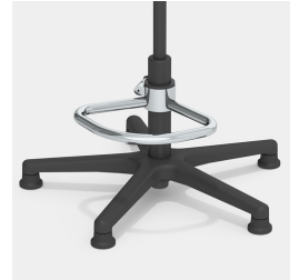
Optionally with partial foot ring