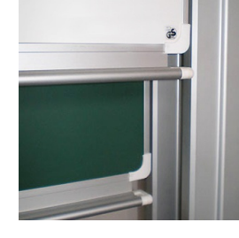
Two writing surfaces can be moved one behind the other