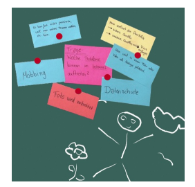
Magnetic surface can be written on with chalk

A2S-Furnishing Systems Ltd. ASS-Einrichtungssysteme GmbH info@a2s.com WWW.A2S.COM