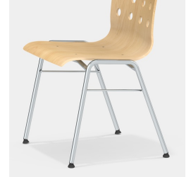
Robust 4-leg frame