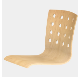
Body contoured seat shell