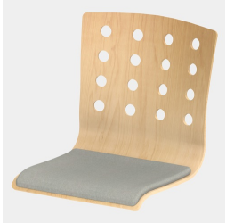
Optionally with seat upholstery