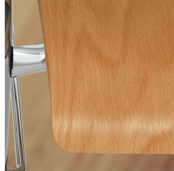
Seat shell environmentally friendly lacquered with water-based varnish