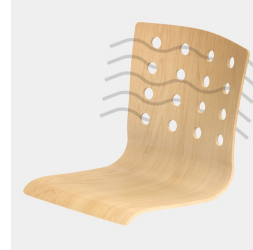
Seat shell with round cut-outs ensures optimum air circulation