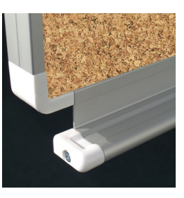
Matching shelf for chalk and pens