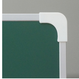
Edge protection due to rounded safety corners