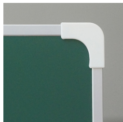
Edge protection due to rounded safety corners