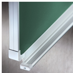
Matching shelf for chalk and pens