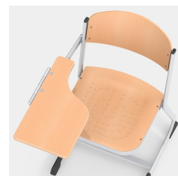
Stable and solid C-shape frame with writing surface