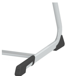
Floor protectors with integrated step protection