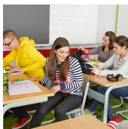
No disturbance of the chair legs when getting in and out of the chair