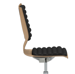
Seat tilt mechanism with weight adjustment