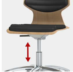
Height adjustment by safety gas spring