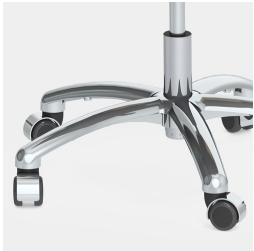
Extremely robust aluminum base