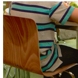
Ergonomically shaped and flexible shell