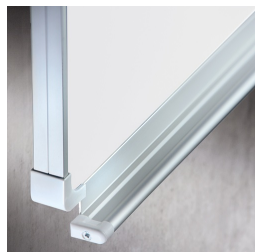
Matching shelf for chalk and pens