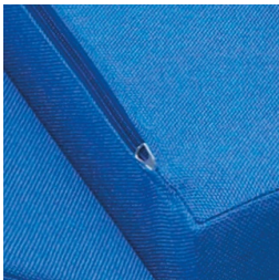
Cover removable by zipper