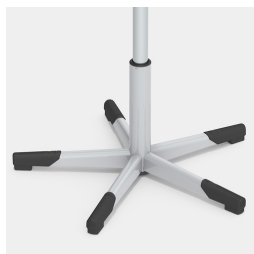
Extremely robust steel base