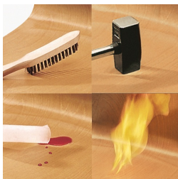
Indestructible PAGHOLZ® shell, scratch, break and impact resistant; flame retardant