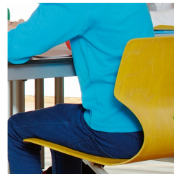
Ergonomically and orthopedically adapted shell shape