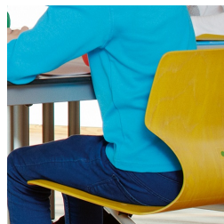
Ergonomically and orthopedically adapted shell shape