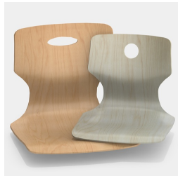
Optionally with grip hole, round or oval