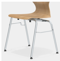
Robust 4-leg frame