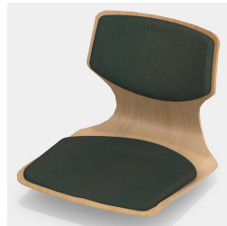
Optionally with seat and backrest upholstery (only sizes 6E, 7)