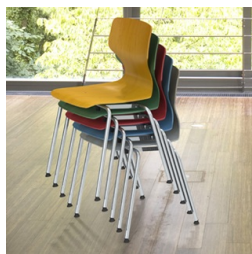
Stackable up to 8 chairs (without upholstery)