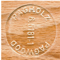
PAGHOLZ® from sustainable forestry