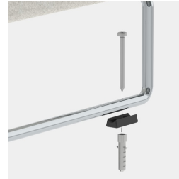
Optional mit geschraubter oder geklebter Bodenbefestigung