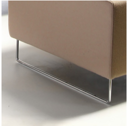
Stable sled frame optionally chrome-plated