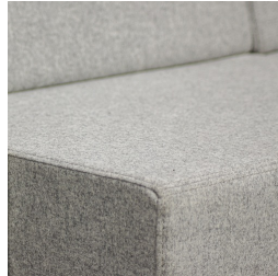
Durable due to high quality workmanship