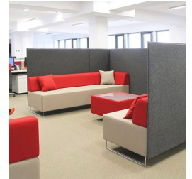
Individually extendable through interlinkable elements