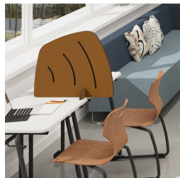
Als Sichtschutz auf Schultischen

Our range of materials and colors can be found in the A2S material overview.