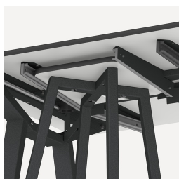
Halterung für FLEXLAB Hocker und Tidy Boxen