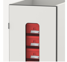
Die verglaste Front gibt freie Sicht auf die Materialien