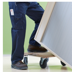
Carcass firmly doveled and glued ex works