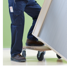
Carcass firmly doveled and glued ex works