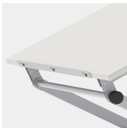
Optionally with book stop bar