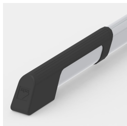
Floor protectors with integrated step protection