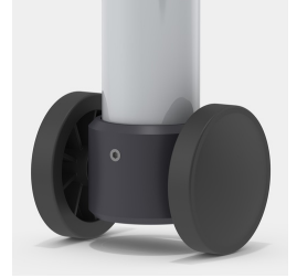
Optional frame mobile by means of 2 fixed castors