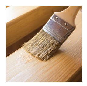
Painted with environmentally friendly water-based paint.