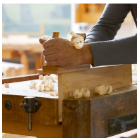
Solid beech wood from sustainable forestry with water-based varnish