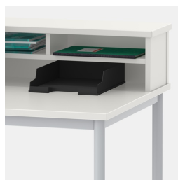
Storage compartment creates order and preserves overview