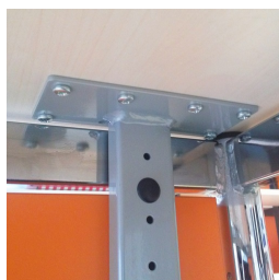
Firmly screwed with table top

Our range of materials and colors can be found in the A2S material overview.