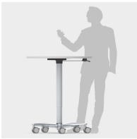
Can also be used as a mobile lectern