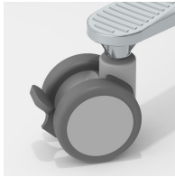
Including 5 robust double swivel casters with total locking device