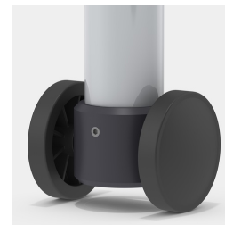
Optional frame mobile by means of 2 fixed castors