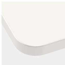
Optional table top with 40 mm corner radius