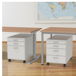
Suitable for our OFFICE tables and 1000, 2000 table series