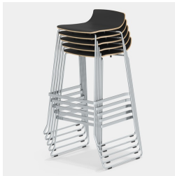
Stackable up to 5 stools