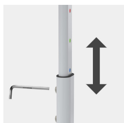
Height adjustable by means of locking device