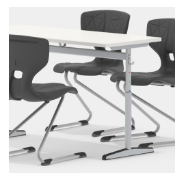
Seating on both sides due to central column frame