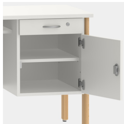
Base cabinet includes drawer, lockable by means of safety lock