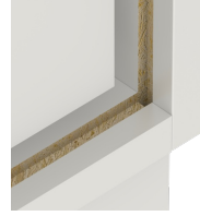
Resistance to warping due to 8 mm thick back wall