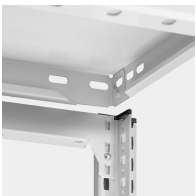
Plug-in system without screws