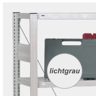
Robust steel frame