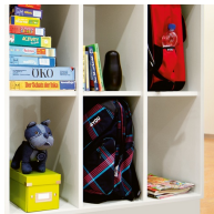
Compartments adapted to school satchels.