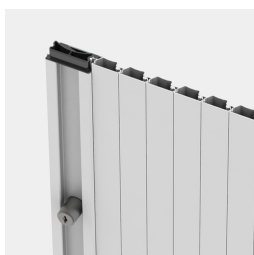
Stable guide rails