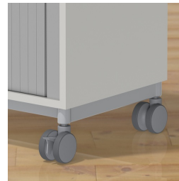
Pupil compartment shelves optionally mobile with castors.