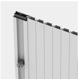
Stable guide rails