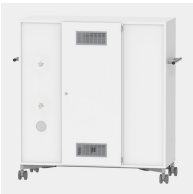
Lockable door for easy connection of the devices